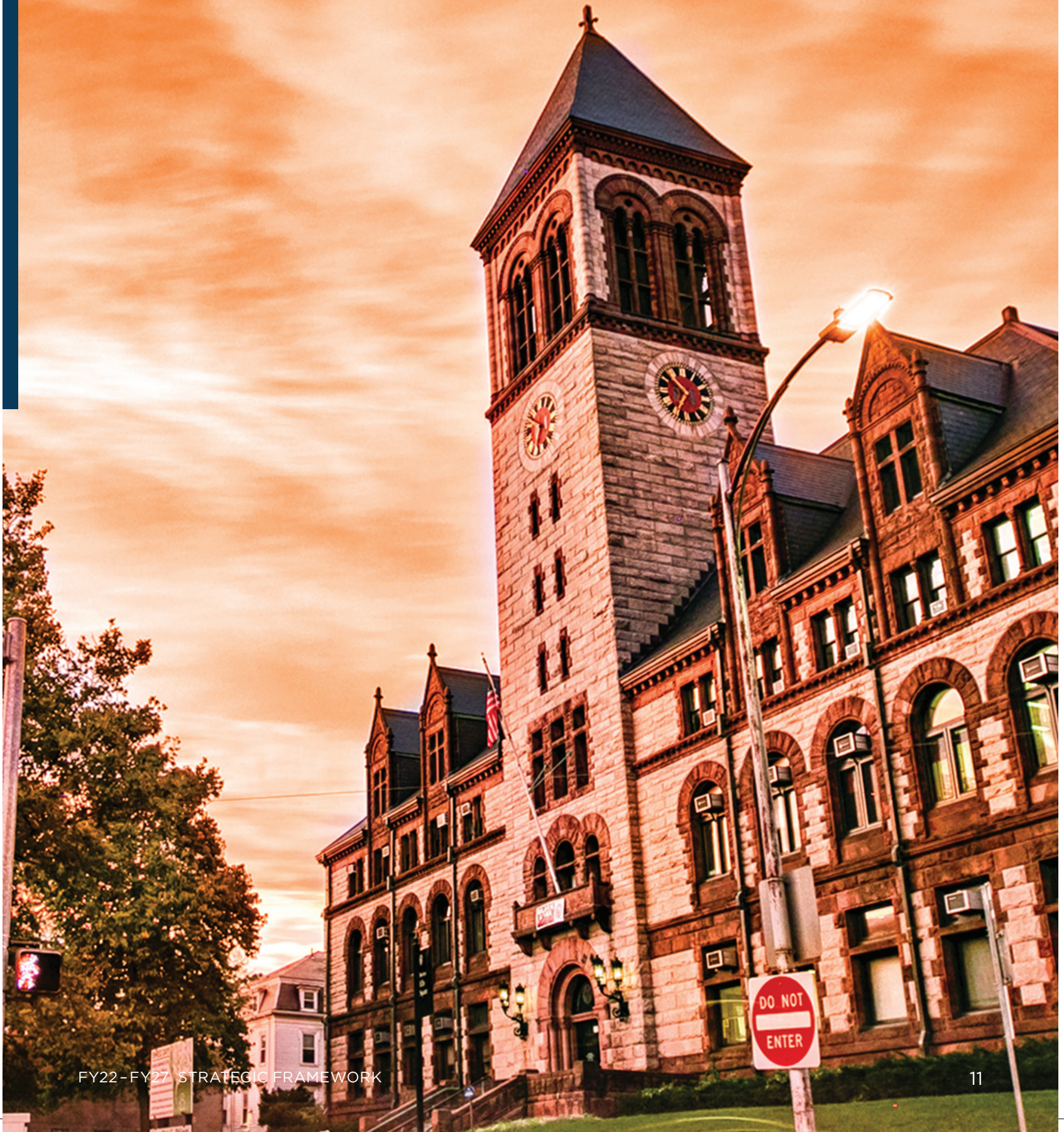
Cambridge City Hall