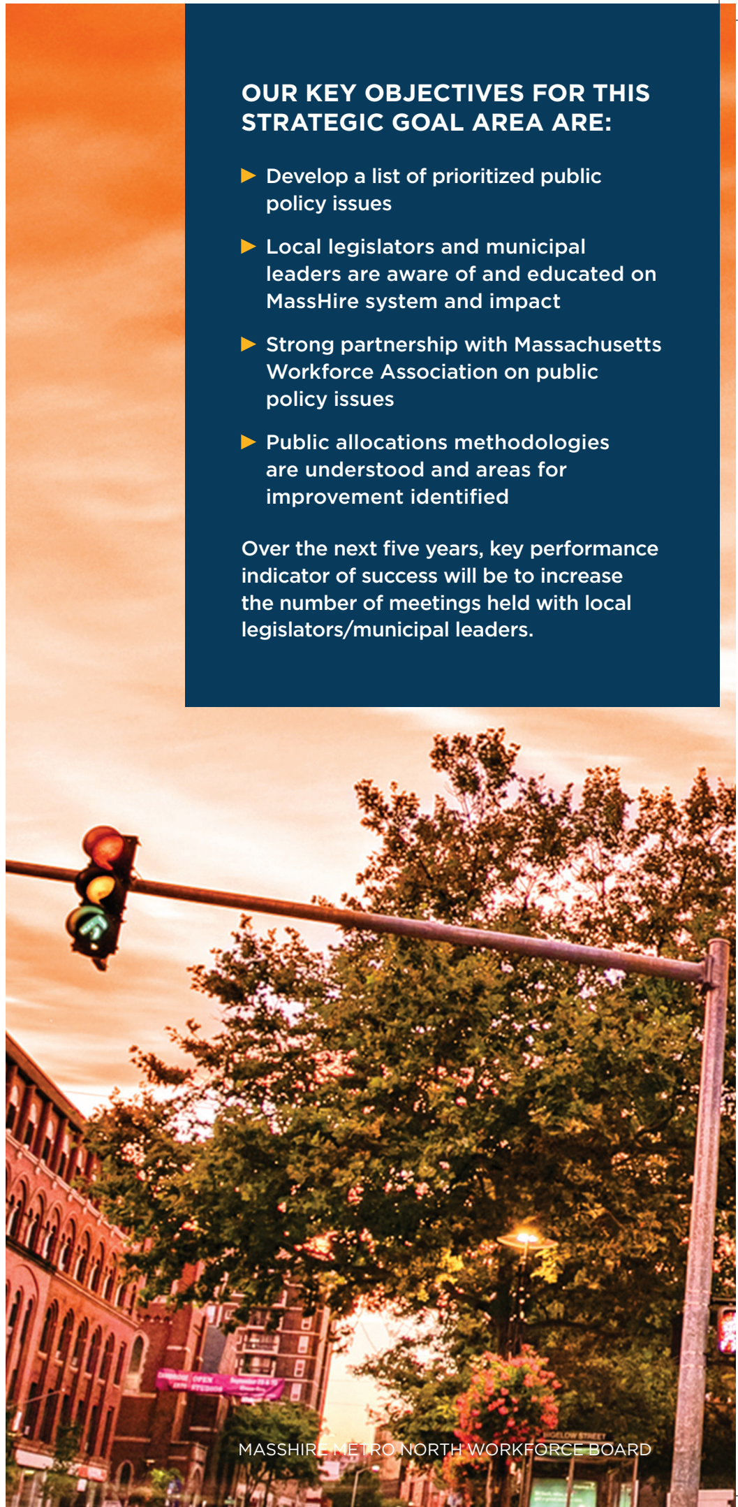
MASSHIRE METRO NORTH WORKFORCE BOARD

Over the next five years, key performance indicator of success will be to increase the number of meetings held with local legislators/municipal leaders.