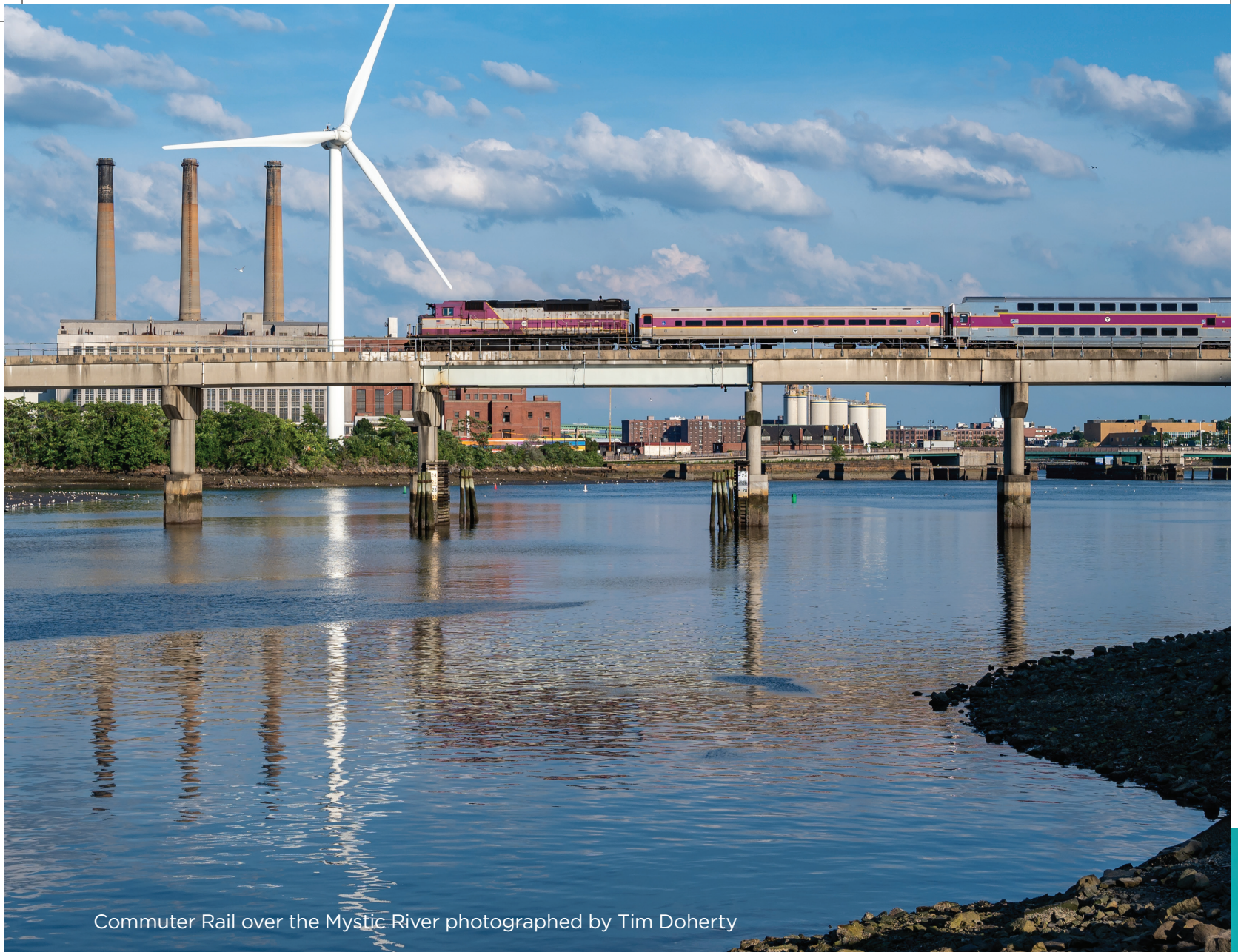
Commuter Rail over the Mystic River